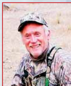
"Map and Compass Skills" by Dave Doran Friday, 3:00pm

We'll have 2 special, limited-attendance workshops during the convention. You'll need to sign up for them at the registration table before hand.